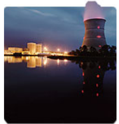
2009 Generation Sources